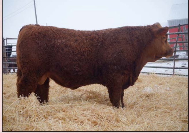
CPI King Red 216Y KLSR MS 205Z

WS Beef King W107 CPI MS Recoil 1287 OLF Red Patriarch W124 821