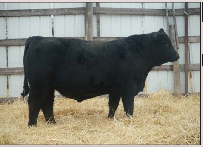
KOP Grizzly 161A MLC Extra 205 U336

CE BW WW YW MCE MM MWW MARB REA API TI 13.6 1.1 67.3 101 8.2 29.9 63.5 1.17 6 129.3 70.6 Long sided, thick and powerful calf out of a first calf heifer. Grandam is the mother to the C538 calf in the sale. Great grandam has the C512 heifer in the sale. C569 was tied for our #1 gaining bull. Very complete calf backed by some great cows. Should be Homozygous polled by pedigree.