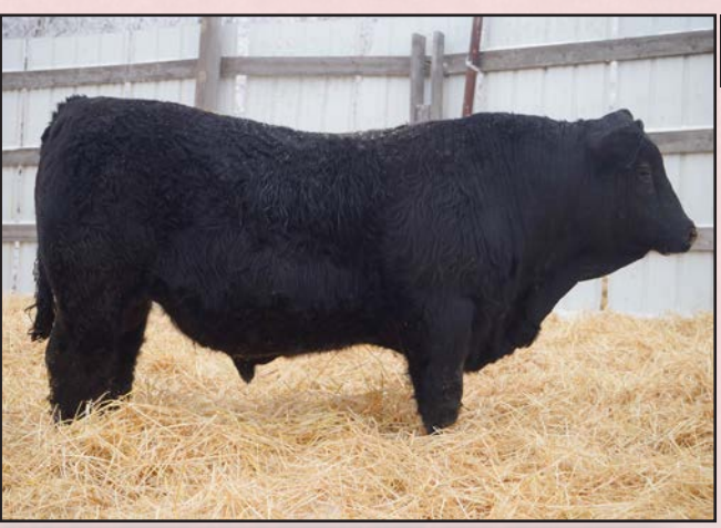
KLSR Perfect Image Y1 KLSR Regina A5

HA Image Maker 0415 KLSR Ms Hummer 918W LCHMN Bright Light L122L KLSR Shine Y6