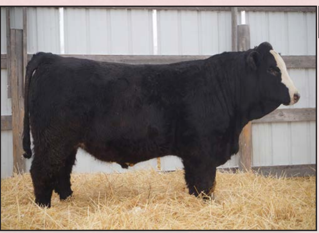
KBHR Supreme Beef A007 GW-WBF Substance 820Y KBHR T281 KLSR Z30 HA Image Maker 0415 KSR Princess 831T

Another heavy muscled Tanker son here. Dam is a big bodied Real Break cow that always raises a good calf.