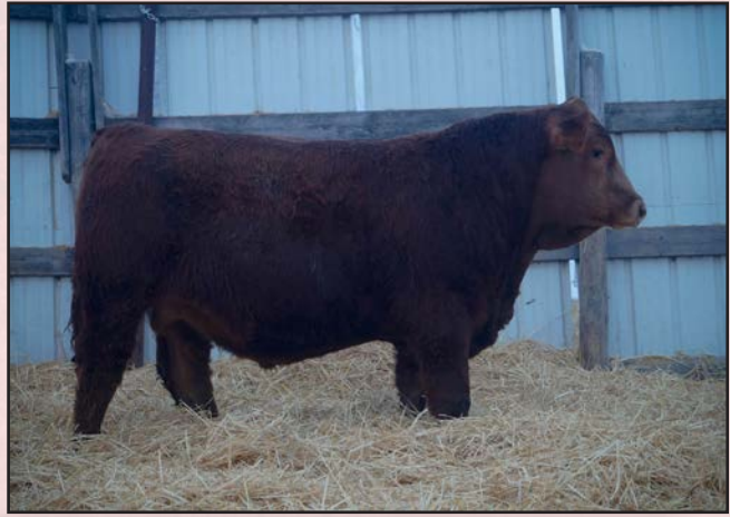
Traxs Rushmore X103 DKSR Ms Yukon A412

THSF Freedom 300N Miss Trax U850 Hooks Yukon 80Y PSR Miss Gunner W053