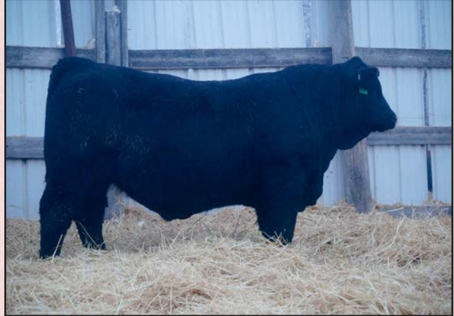
TNT Tanker U263 KSR Horizon 836T

Mr NLC Superior S6018 TNT Miss S17 Sarge F6039 935H