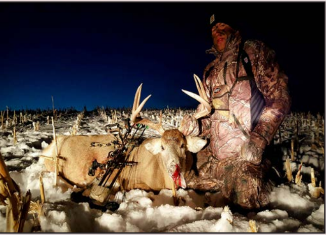
THSF Freedom 300N

CE BW WW YW MCE MM MWW MARB REA API TI 5.4 3.6 61.1 93.2 9.6 25.8 56.4 -0.1 .79 93.4 56.9 Standout Grizzly son all year. Out of our Y6 cow who has done and outstanding jobs with her first 3 calves. She had a calf in our sale last year and her first calf we retained and is the dam to the C569 calf in the sale. Grandam has the C512 open heifer in the sale also. This guy is thick, heavy muscled, and stylish, and backed by a great cow family. Homozygous polled, Homozygous black.