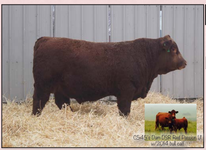
THR Northern 2109