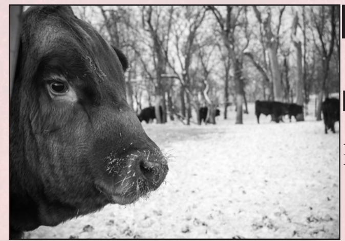
TNT Tanker U263 PSR Tea Time R843

Mr NLC Superior S6018 TNT Miss S17 PSR Real Break N29 PSR Teaberry J94