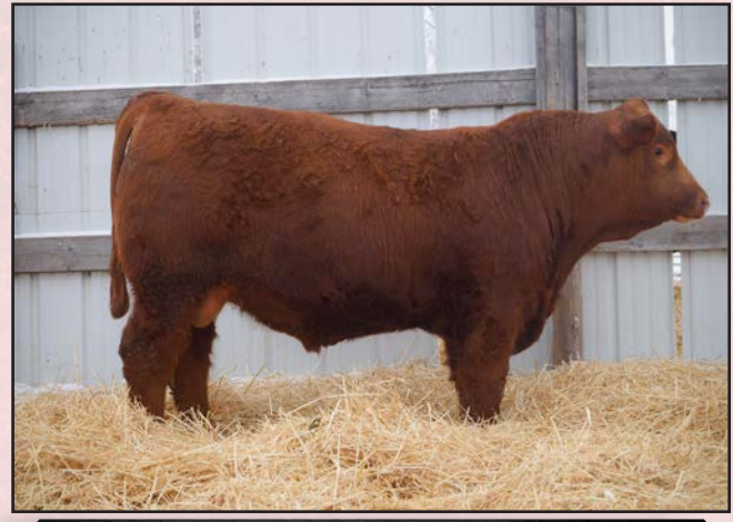
HXC Conquest 4405P