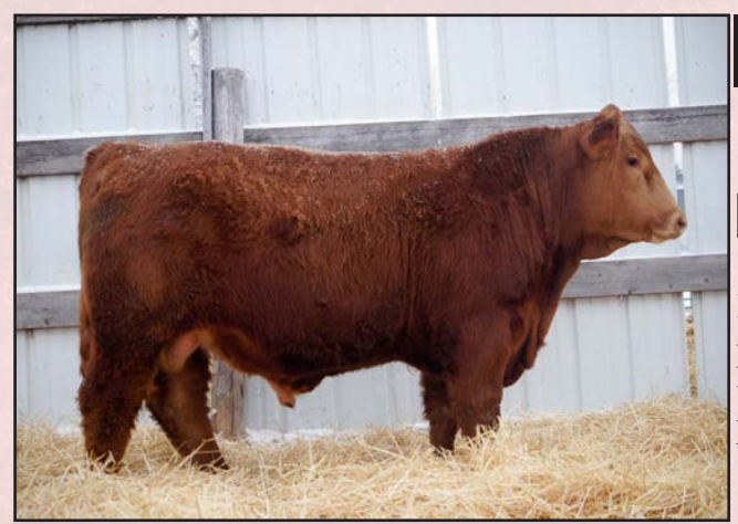
CPI King Red 216Y X1

Powerful King Red son with added frame. Dam has been very productive for us. A full sister to C503 raised her first calf for us and did great. King Red females have great udders, are easy keeping, moderate, and are the front pasture kind.