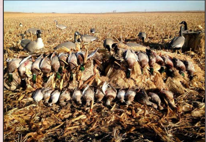
KLSR Morning Pove Y10