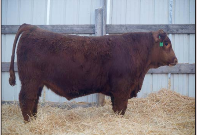
HXC Conquest 4405P

CE BW WW YW MCE MM MWW MARB REA API TI 15.6 -1.5 73.9 101.8 10.9 28.1 65 0.34 .32 148.3 78.6 Real good 1/2 blood here. We bought his dam from Kenners in there 2015 production sale. She did great with her first calf posting a 108 BWR, 103 WWR, 107 YWR. C546 could be a bull that could be mated with heifers to mature cows. Will add calving ease while increasing performance and muscle. Homozygous polled, non dilutor