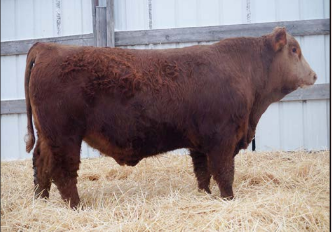
OLF Red Patriarch W124

Long bodied and attractive. Solid black with a blaze face. Dam is a stylish smooth made young cow with a perfect udder. should be homozygous polled by pedigree.