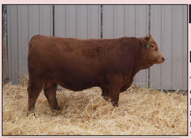
CDI King Red 216Y

WS Beef King W107 CPI MS Recoil 1281 THSF Freedom 300N KBHR T180