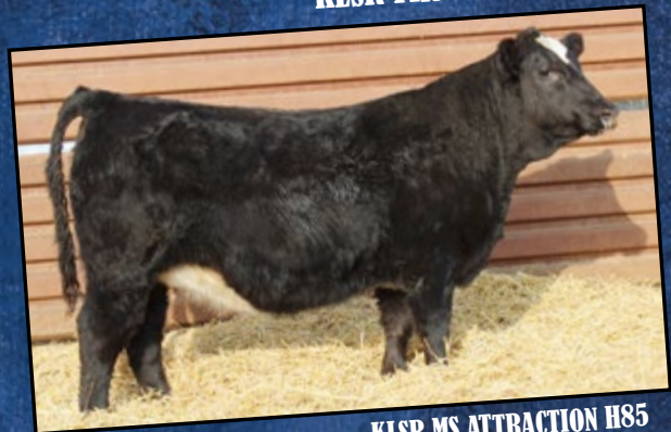
KLSR MS ATTRACTION H85