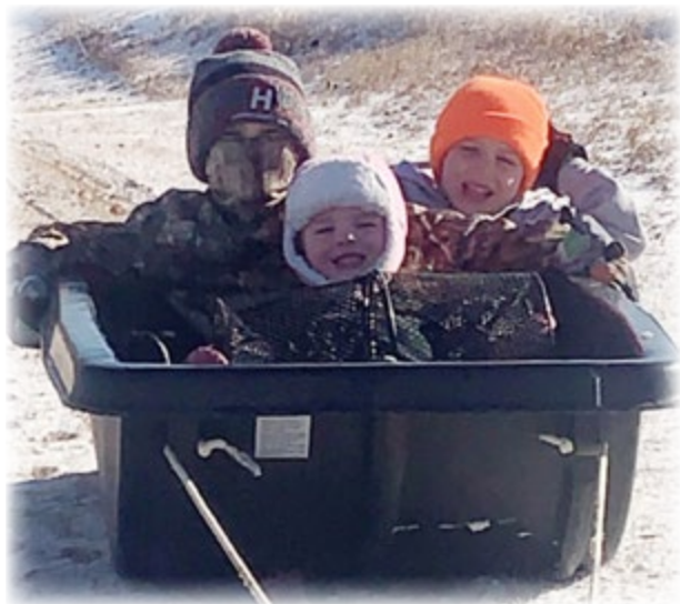
Calving season fun!