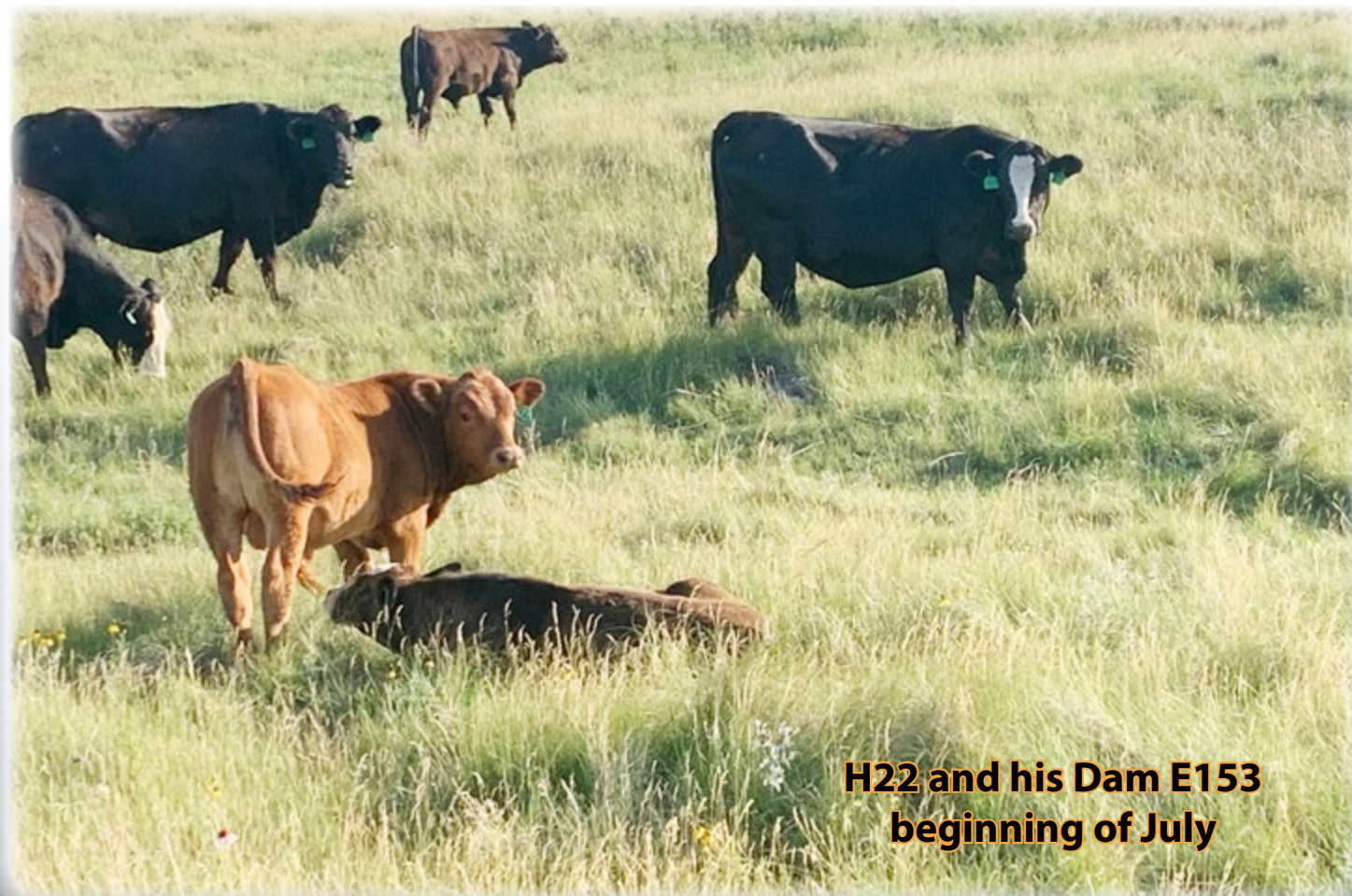
H22 and his Dam E153 beginning of July