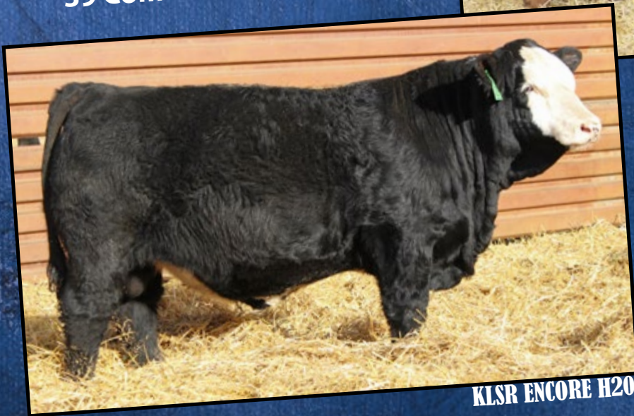
KLSR ENCORE H20