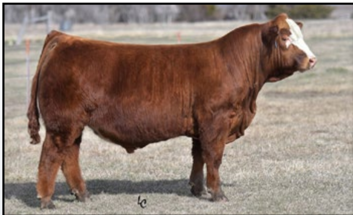
Mr SR Redwood D1139 • Sire of H21 and H26, also a Bred Heifer Service Sire

Exposed to KLSR Nation Wide E702 May 25 – August 1st, Ultrasound safe, due March 21.