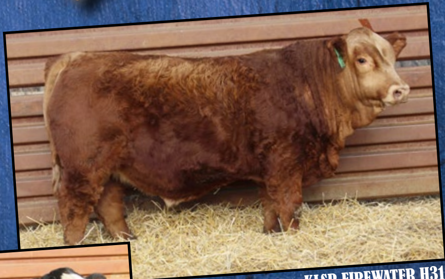
KLSR FIREWATER H31

Selling: 50 Simmental and SimAngus™ Bulls 7 Coming 2-Year-Old Bulls 20 Registered Bred Heifers 30 Registered Open Heifers 39 Commercial Bred Heifers